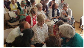
EUROPEAN SSE COURSE 1, MODULE 1 VILNIUS, LITHUANIA