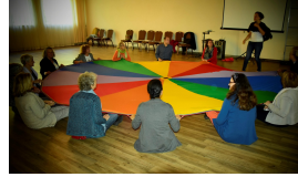
EUROPEAN SSEHV MEETING LODZ, POLAND