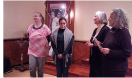
PROJECT PRESENTATIONS BUDAPEST, HUNGARY